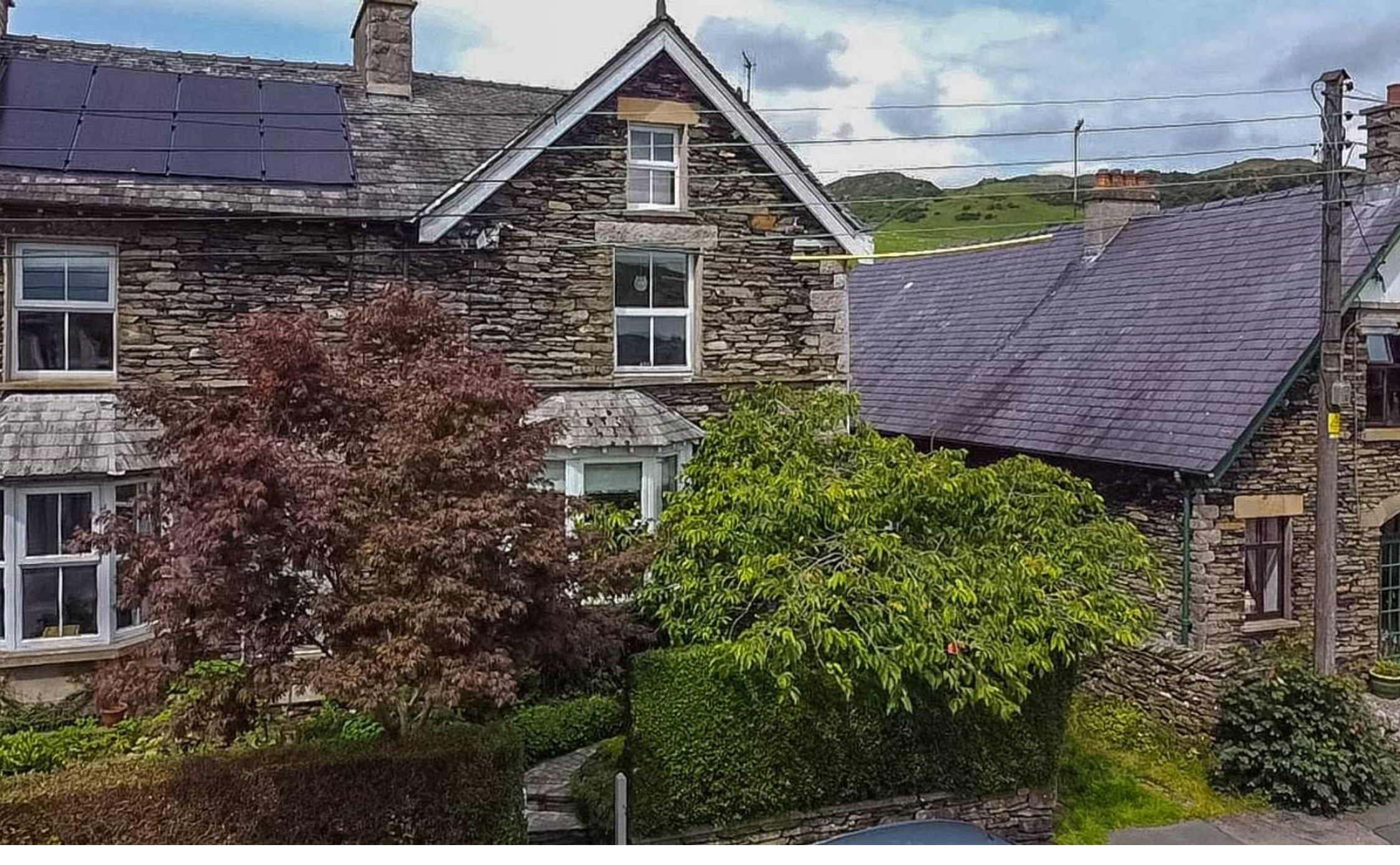
Selwyn Station Road, Staveley £530,000