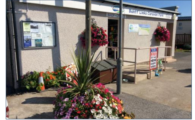
Aberdeen 47 miles