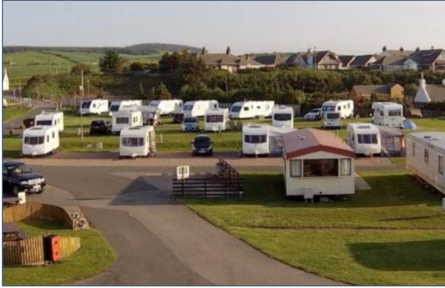
Macduff 3 miles