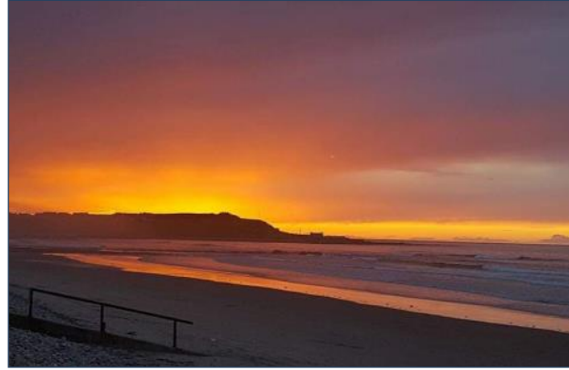
Huntly 21 miles