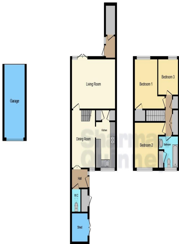
Ground Floor First Floor

This floor plan is for illustrative purposes only. It is not drawn to scale. Any measurements, floor areas (including any total floor area), openings and orientation are approximate. No details are guaranteed, they cannot be relied upon for any purpose and they do not form part of any agreement. No liability is taken for any error, omission or misstatement. A party must rely upon its own inspection(s). Powered by www.focalagent.com