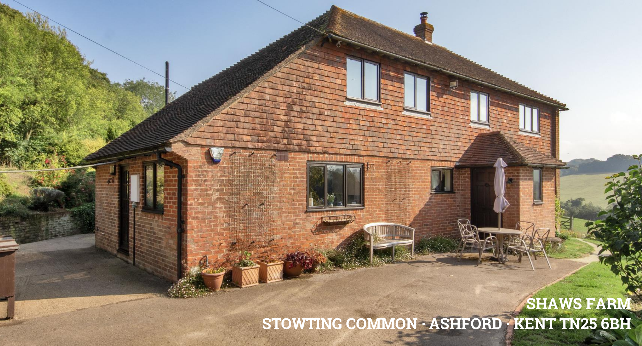
SHAWS FARM STOWTING COMMON · ASHFORD · KENT TN25 6BH