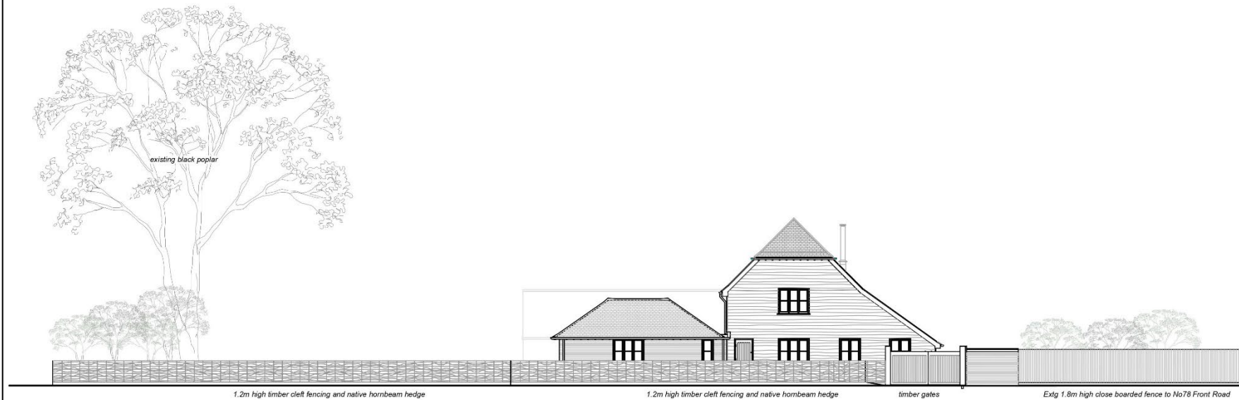
EAST ELEVATION 1:200 @ A3