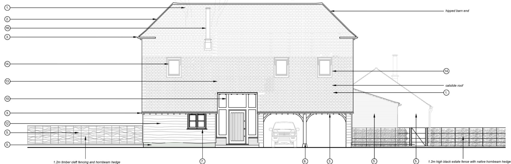
NORTH ELEVATION 1:100 @ A3