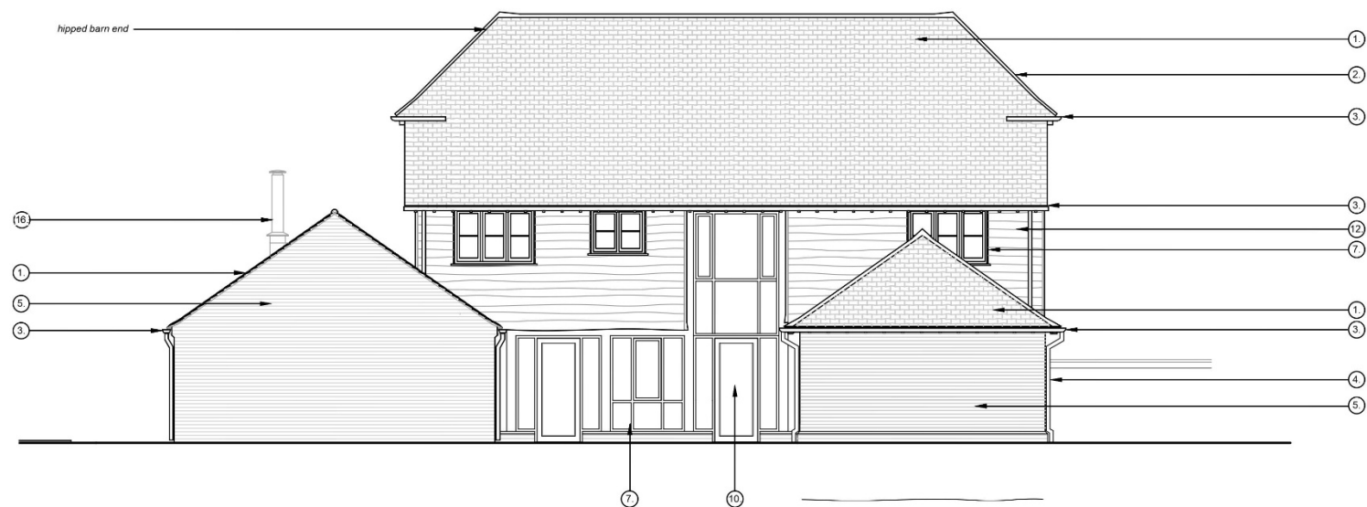
SOUTH ELEVATION 1:100 @ A3