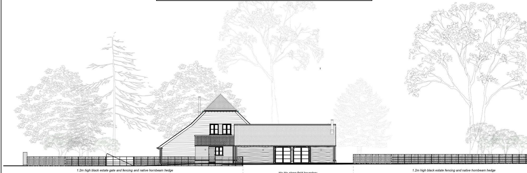
WEST ELEVATION 1:200 @ A3