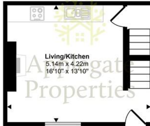
Ground Floor Approx 21 sq m / 231 sq ft