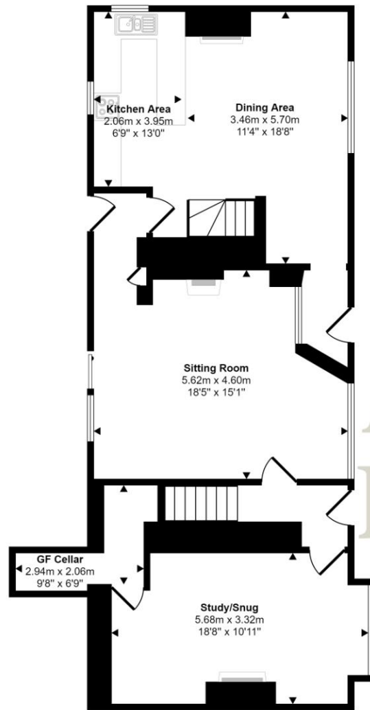
Ground Floor Approx 90 sq m / 967 sq ft

Approx Gross Internal Area 222 sq m / 2391 sq ft