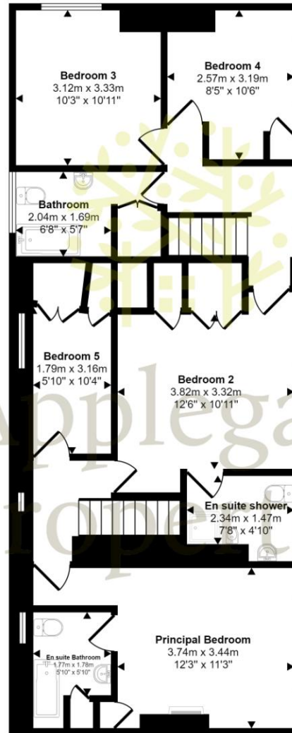
First Floor Approx 91 sq m / 982 sq ft