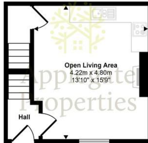
Ground Floor Approx 24 sq m / 262 sq ft