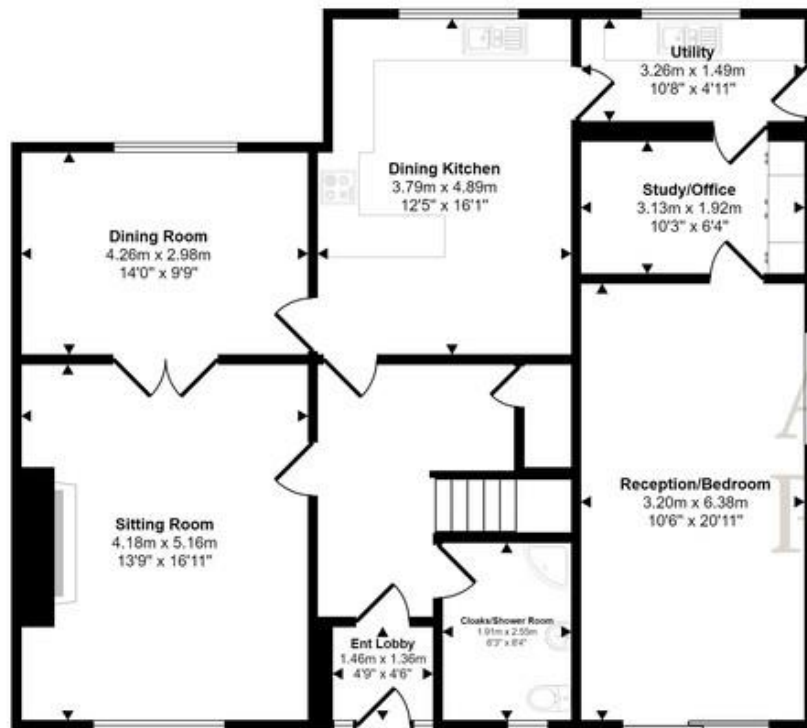
Ground Floor Approx 109 sq m / 1171 sq ft

Approx Gross Internal Area 215 sq m / 2318 sq ft