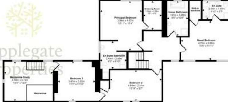
First Floor Approx 119 sq m / 1284 sq ft

This document is only for illustrative purposes and is not to scale. Measurements of rooms, areas, distances, and any other are approximate and no responsibility is taken for any error, omission or misstatement. Suite of items such as bathroom suites are representative only and may not match the real items. Made with Matter Agency Ltd.