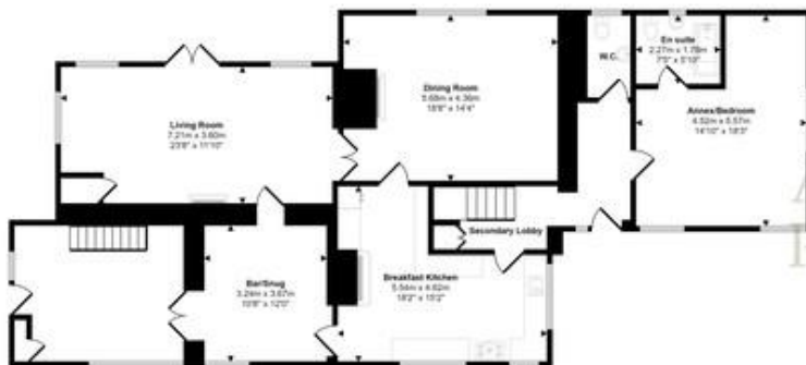
Ground Floor Approx 151 sq m / 1628 sq ft