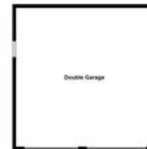
Double Garage Approx 32 sq m / 343 sq ft