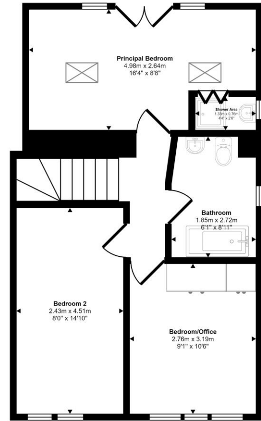
Second Floor Approx 46 sq m / 497 sq ft

This floorplan is only for illustrative purposes and is not to scale. Measurements of rooms, doors, windows, and any items are approximate and no responsibility is taken for any error, omission or mis-statement. Icons of items such as bathroom suites are representations only and may not look like the real items. Made with Made Snappy 360.