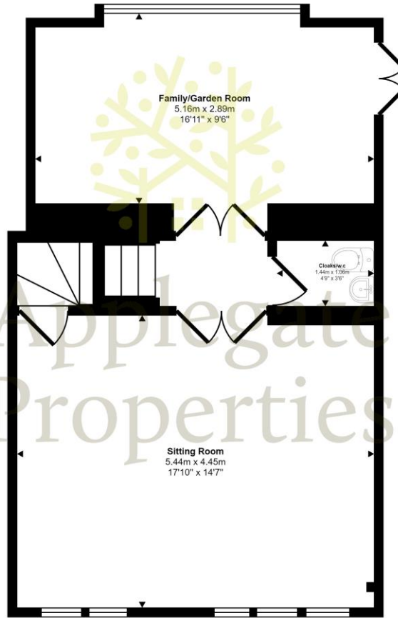
First Floor Approx 48 sq m / 515 sq ft