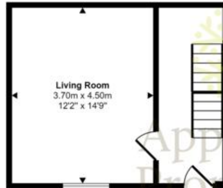
Ground Floor Approx 25 sq m / 269 sq ft