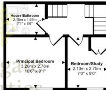
First Floor Approx 25 sq m / 271 sq ft