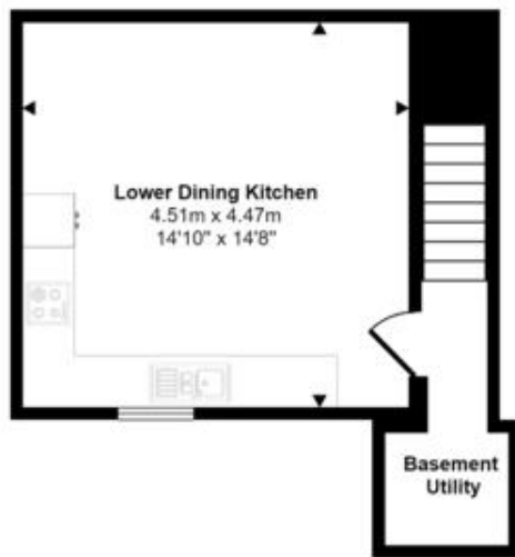
Lower Ground Floor Approx 26 sq m / 284 sq ft

Approx Gross Internal Area 95 sq m / 1025 sq ft