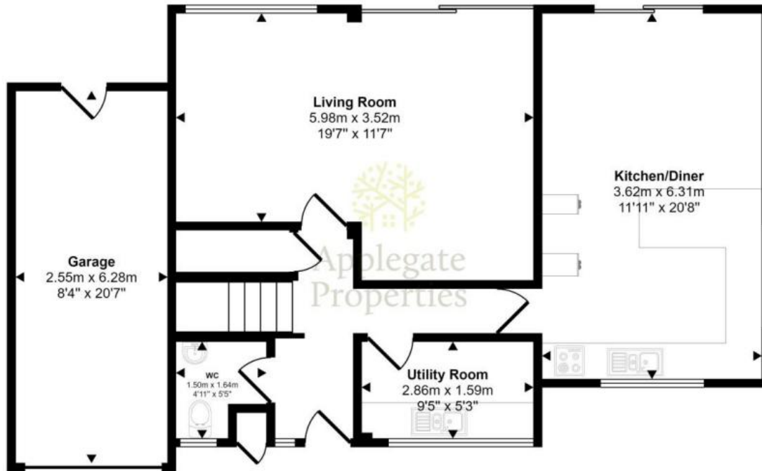
Ground Floor Approx 84 sq m / 902 sq ft

This floorplan is only for illustrative purposes and is not to scale. Measurements of rooms, doors, windows, and any items are approximate and no responsibility is taken for any error, omission or mis-statement. Icons of items such as bathroom suites are representations only and may not look like the real items. Made with Made Snappy 360.