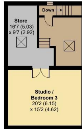
ANNEXE FIRST FLOOR