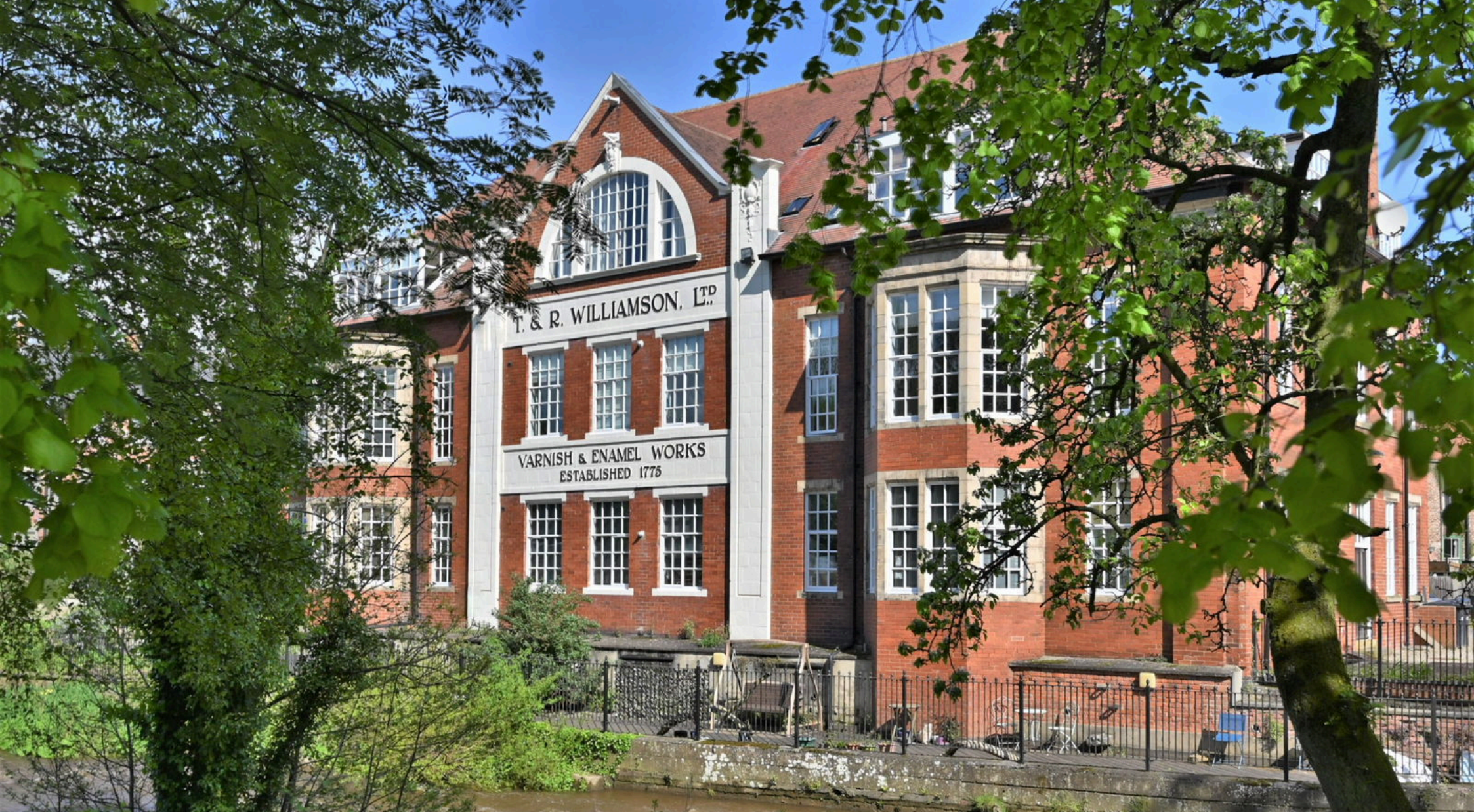
Williamson House, Low Skellgate Close, Ripon, HG4 1WF