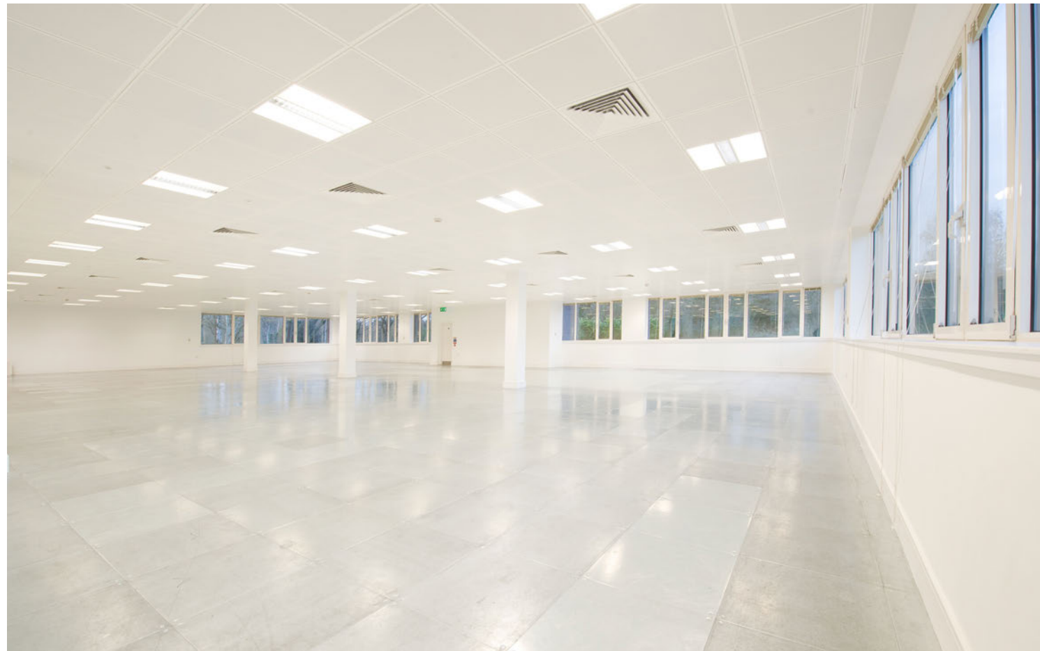
Typical refurbished suite