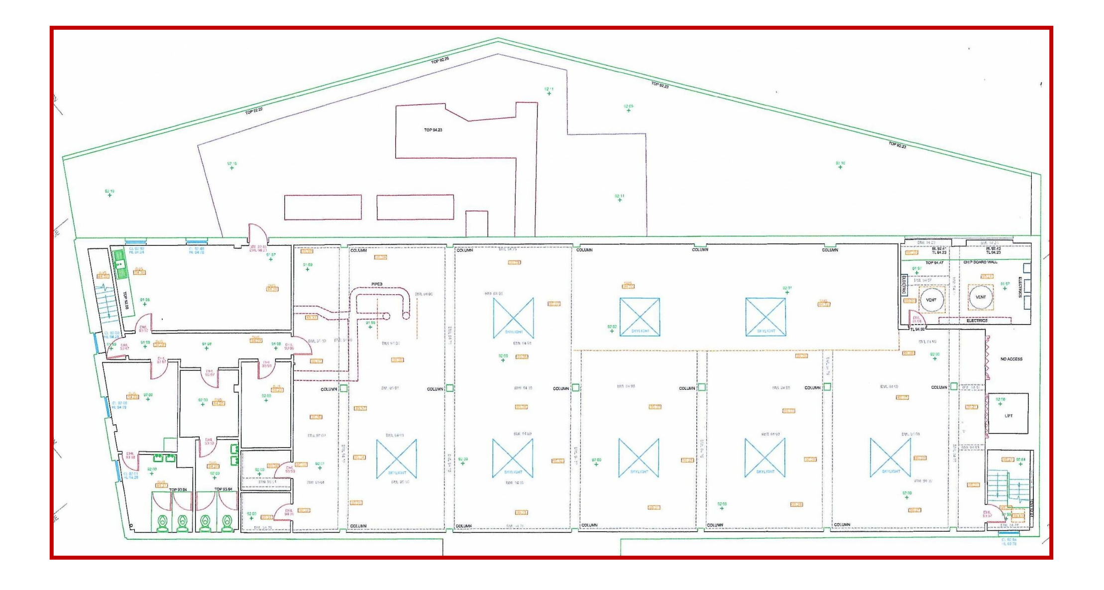
First Floor Plan – Not to scale