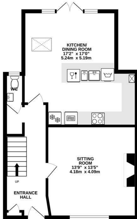
GROUND FLOOR 549 sq.ft. (51.0 sq.m.) approx.