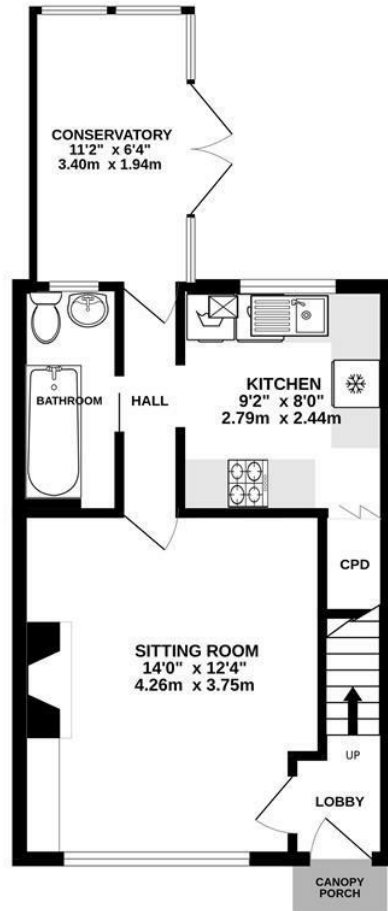
GROUND FLOOR 405 sq.ft. (37.6 sq.m.) approx.