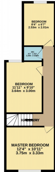
TOTAL FLOOR AREA: 999 sq.ft. (92.8 sq.m.) approx.

Whilst every attempt has been made to ensure the accuracy of the floorplan contained here, measurements of doors, windows, rooms and any other items are approximate and no responsibility is taken for any error, omission or mis-statement. This plan is for illustrative purposes only and should be used as such by any prospective purchaser. The services, systems and appliances shown have not been tested and no guarantee as to their operability or efficiency can be given. Made with Metropac ©2022