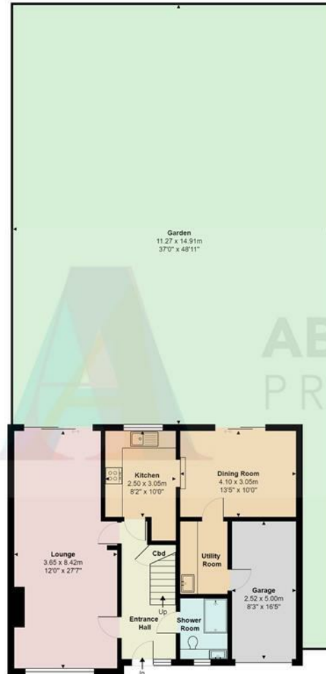
Ground Floor Area: 82.0 m 2 ... 883 ft 2