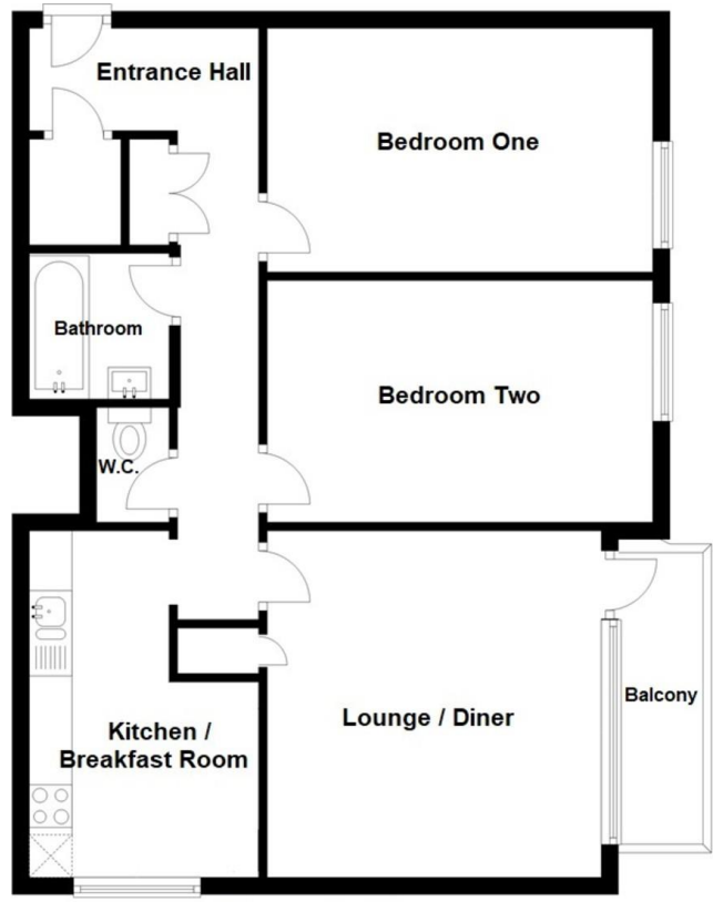
Seventh Floor Approx 74 sq. metres (796.5 sq. feet)

This delightful purpose built two double bedroom apartment offers spacious living accommodation and a wonderful private balcony with beautiful panoramic sea views. Situated on the seventh floor with two lifts and stairs, the property is conveniently located in the heart of Kemp Town within easy walking distance to the local shops, restaurants and seafront. With good transport links too, it is ideal for those who commute in & out of Brighton.