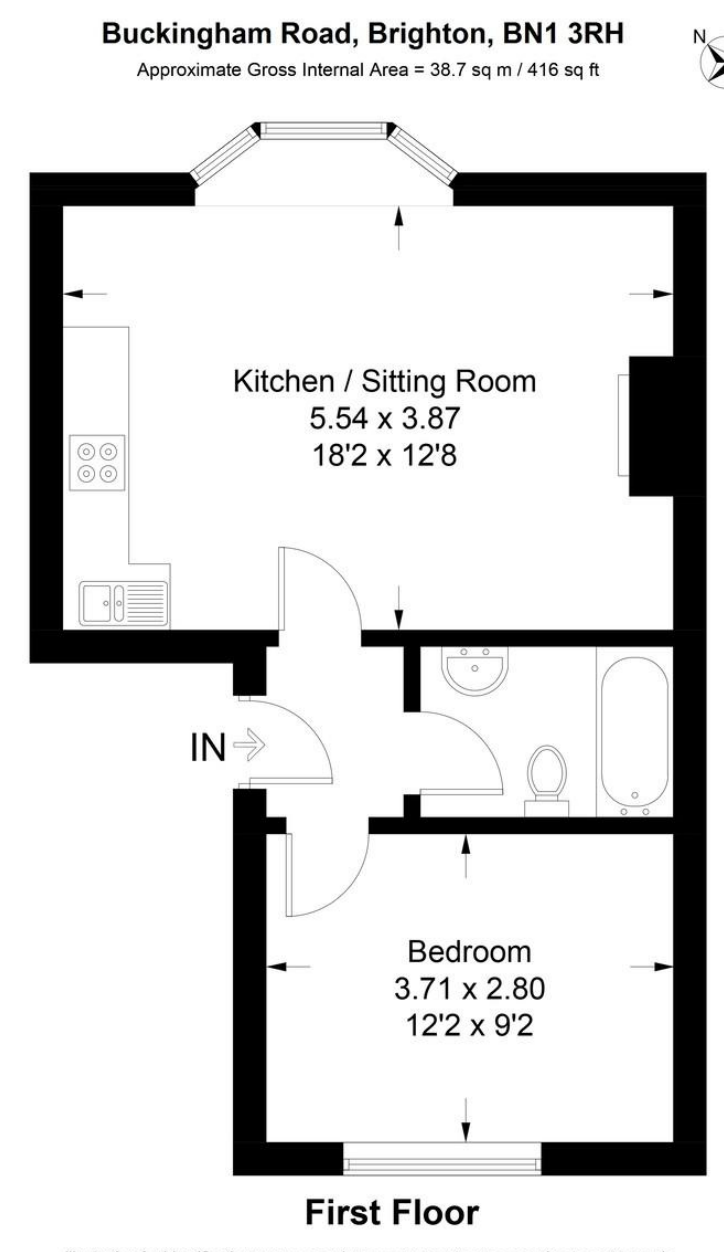
Illustration for identification purposes only, measurements are approximate, not to scale. Imageplansurveys @ 2022

And if you're looking to enjoy all Brighton & Hove has to offer then look no further! You can simply step out of your front door and you are right in the heart of it all with a huge choice of food, drink and entertainment close by in every direction!