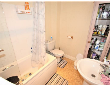
London Road, Portsmouth, PO2 9HJ £145,000

**TWO BEDROOM APARTMENT** **NO FORWARD CHAIN**