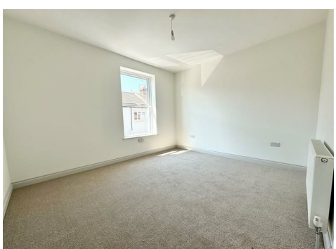
Lawson Road, Southsea, PO5 1SE £269,995

**THREE BEDROOM TERRACED HOUSE** **REFURBISHED THROUGHOUT**