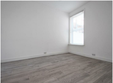
Fawcett Road, Southsea, PO4 0DJ £185,000

**FULL REFURBISMENT** ** TWO BEDROOM GARDEN APARTMENT** *** SHARE OF FREEHOLD ***