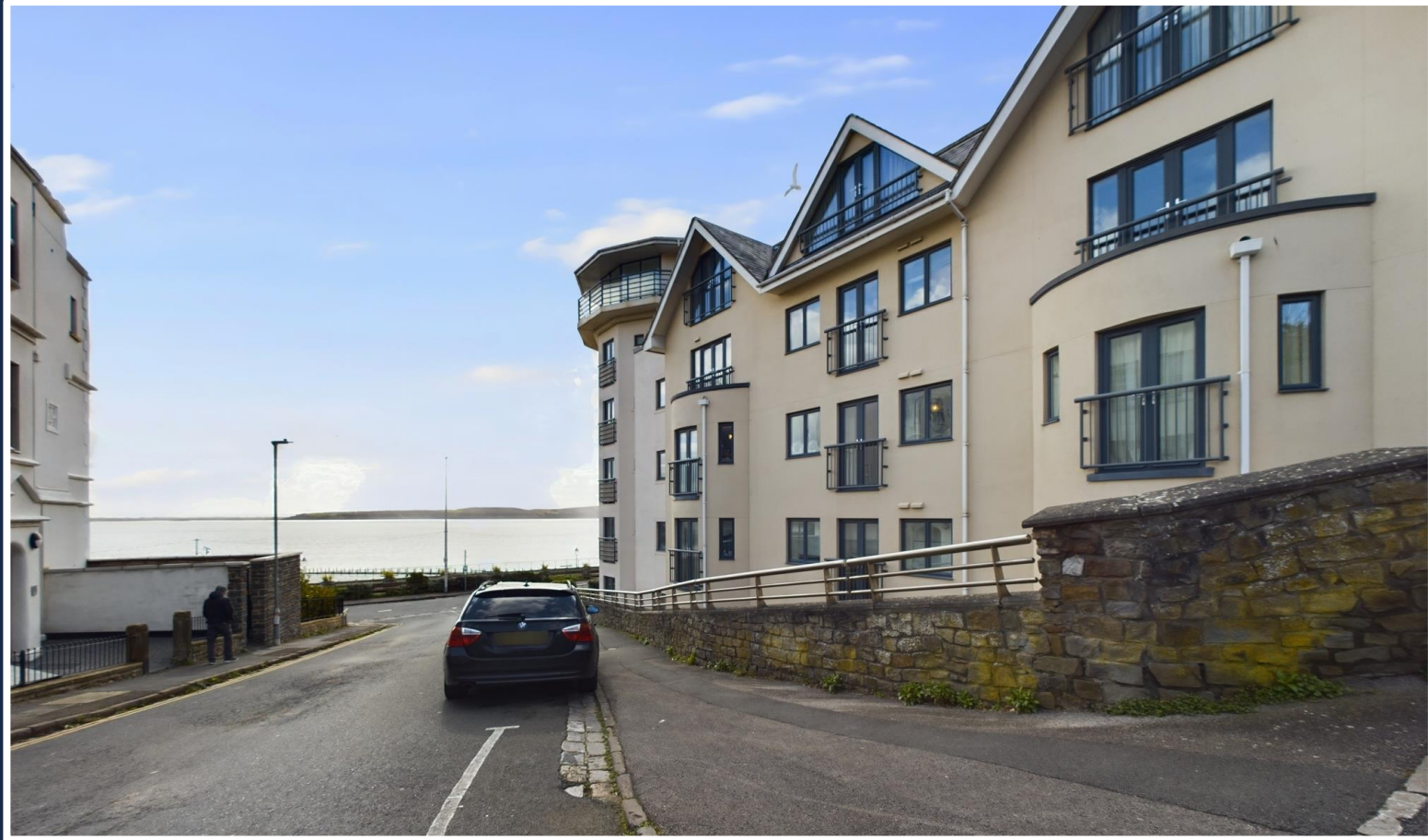
Flat 32, 42 Rozel House Birnbeck Road, Weston-super-Mare, North Somerset, BS23 2BU