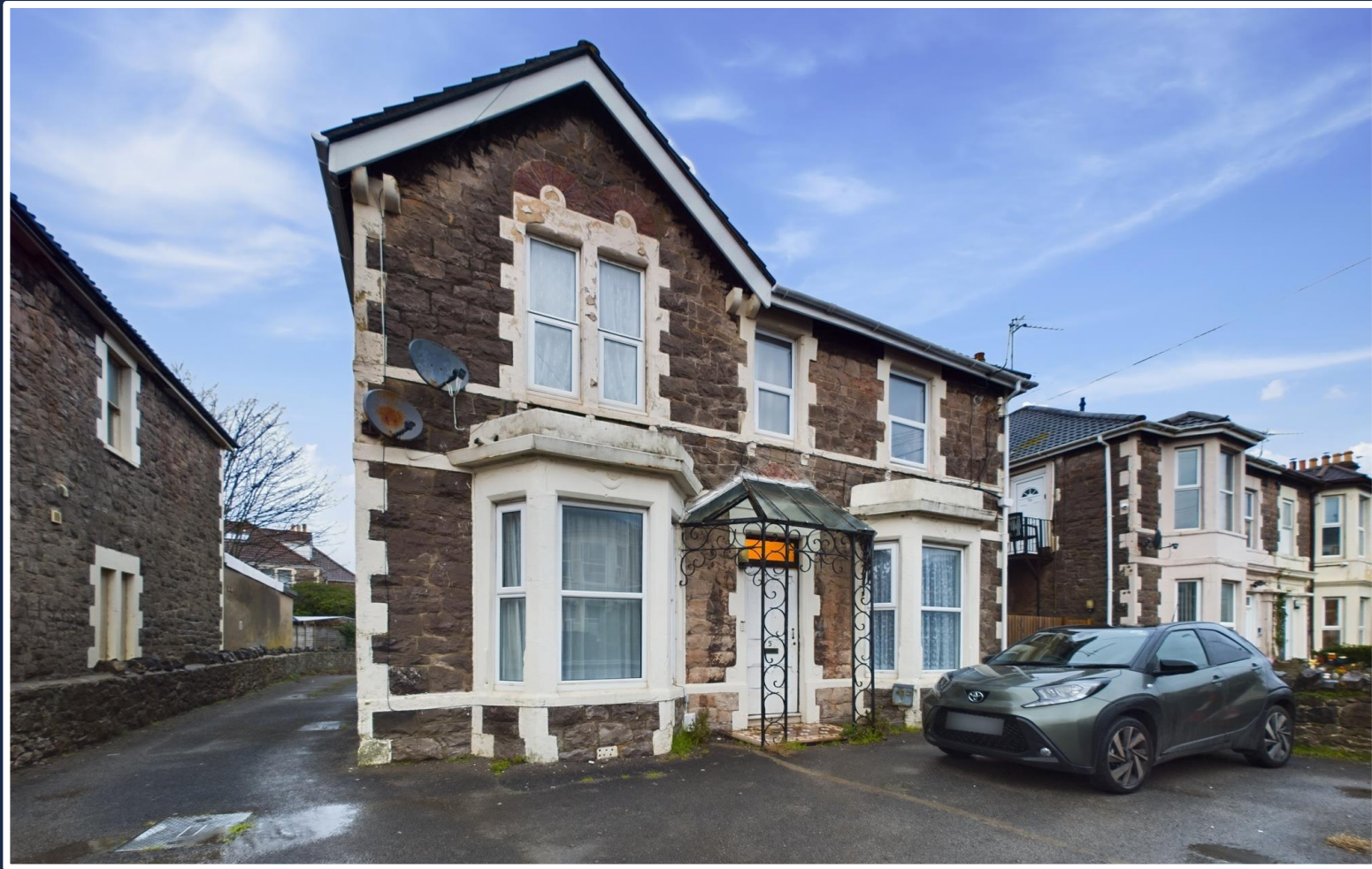
Flat 1, 5 Beaufort Road, Weston-super-Mare, North Somerset, BS23 3BB