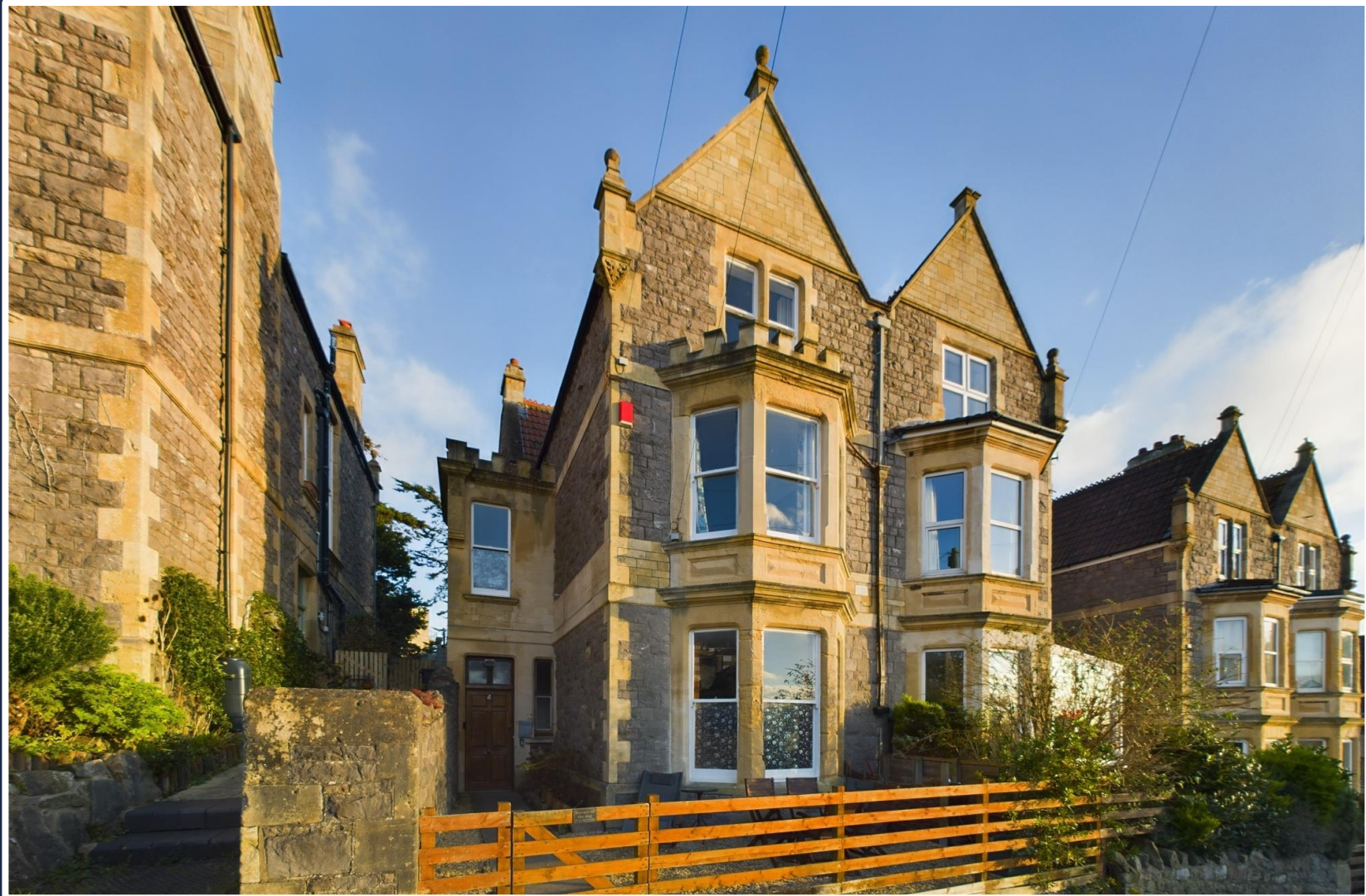
4 Highbury Parade, Highbury Road, Weston-super-Mare, North Somerset, BS23 2DW