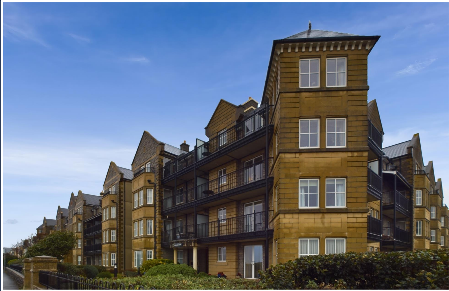
Pegasus Court, Apartment 22, Beach Road, Weston-super-Mare, North Somerset, BS23 4AL