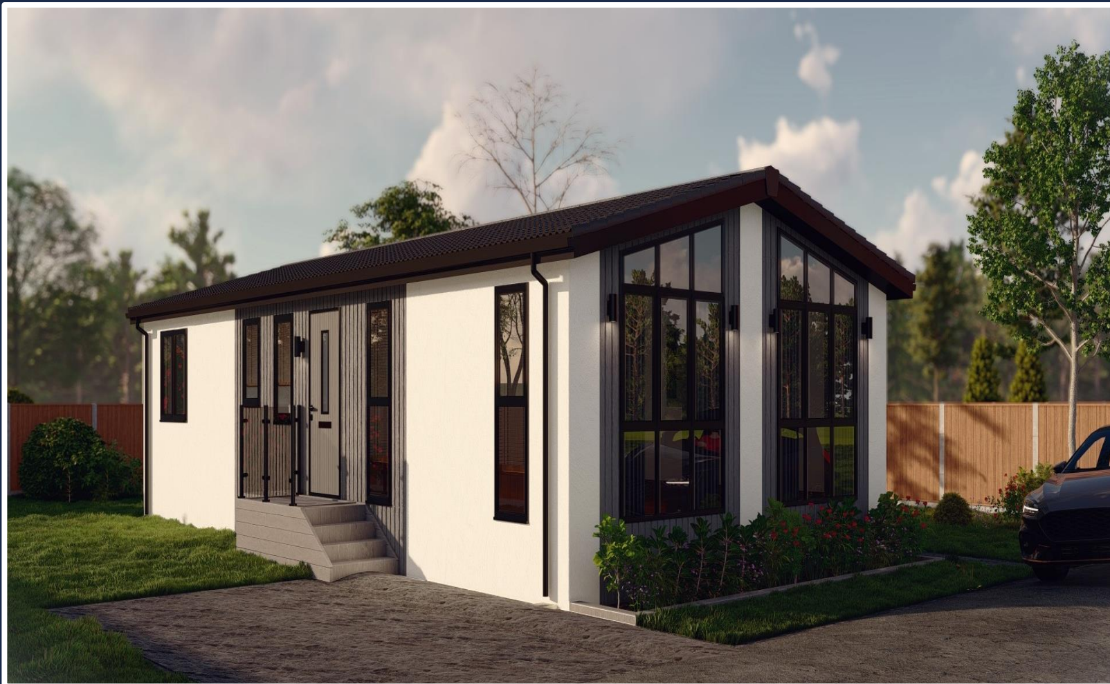
Plot 2 The Green, St Pierre Country Park, Caldicot, Monmouthshire, NP26 5TT