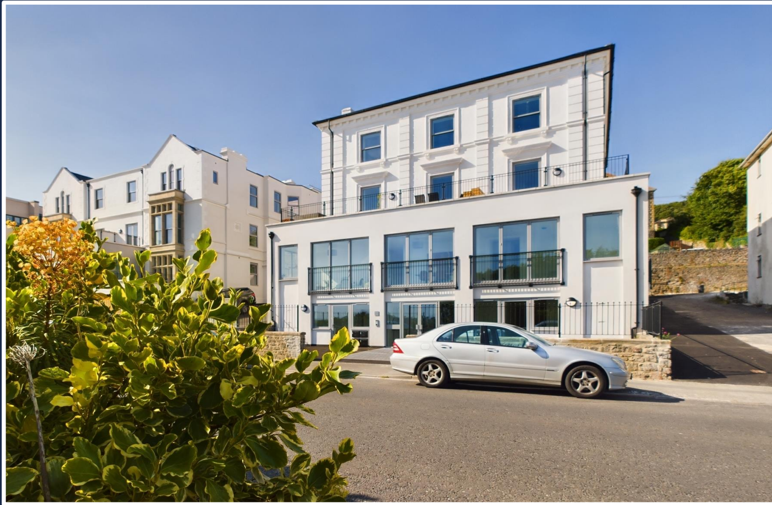
Apartment 7 Birnbeck Lodge, 38 Birnbeck Road, Weston-super-Mare, North Somerset, BS23 2BX