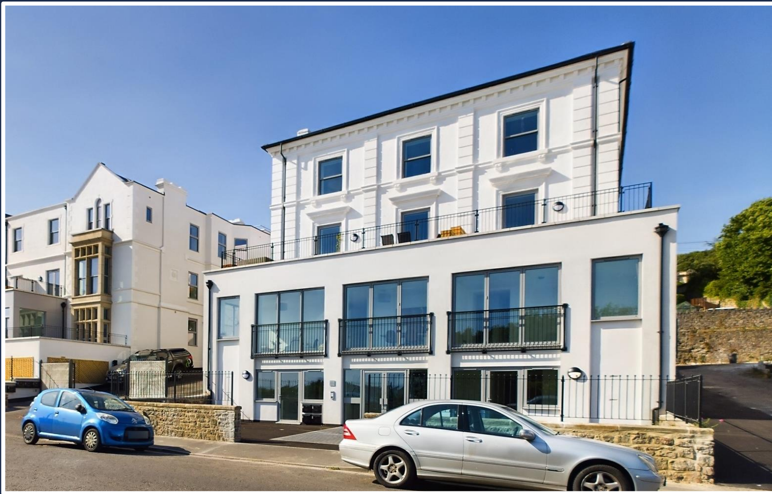
Apartment 5 Birnbeck Lodge, 38 Birnbeck Road, Weston-super-Mare, North Somerset, BS23 2BX