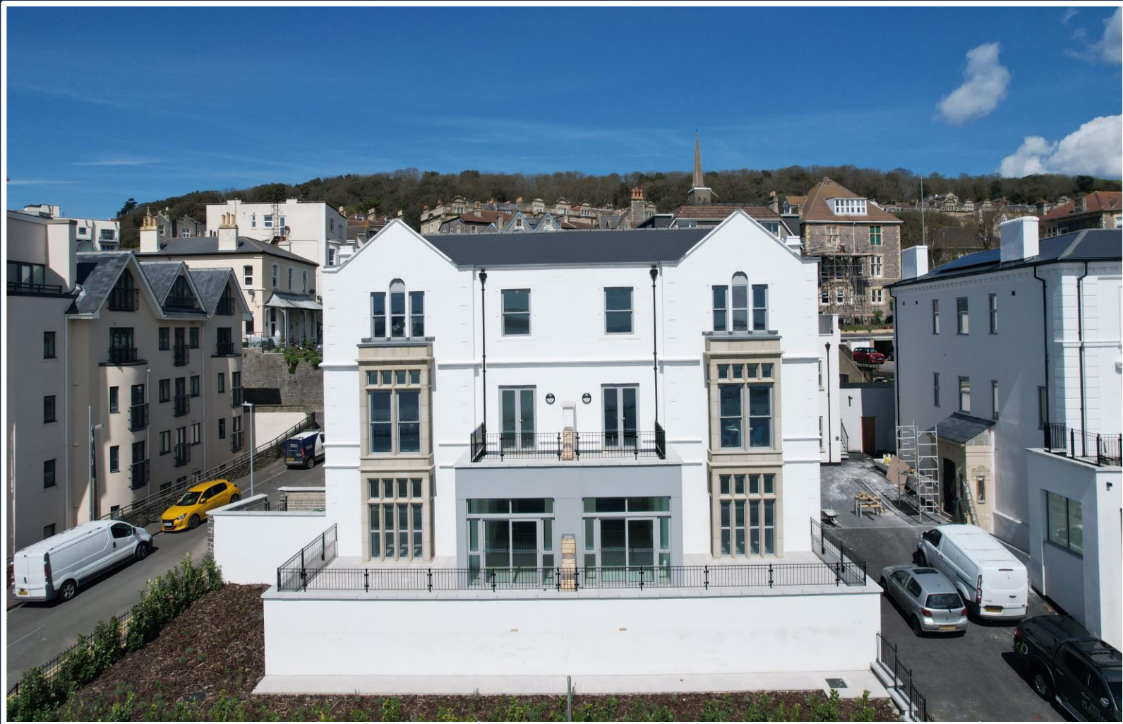
Apartment 9 Rolls Lodge, 2a Paragon Road, Weston-super-Mare, North Somerset, BS23 2DA