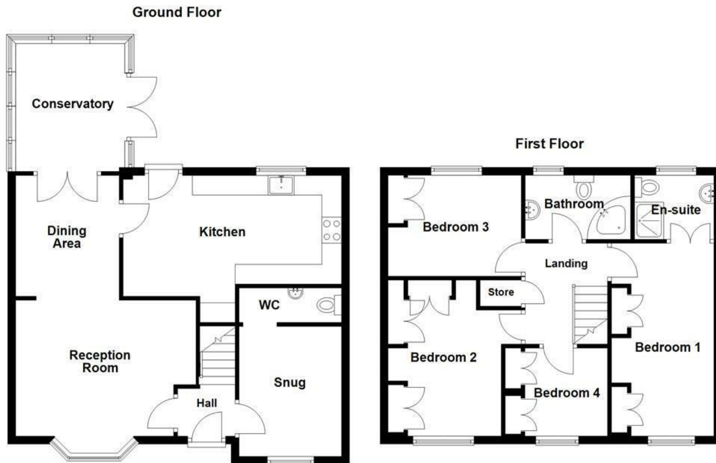
All floorplans are for guidance only. Not to scale. Please check all dimensions and shapes before making any decisions reliant upon them. Plan produced using PlanUp.