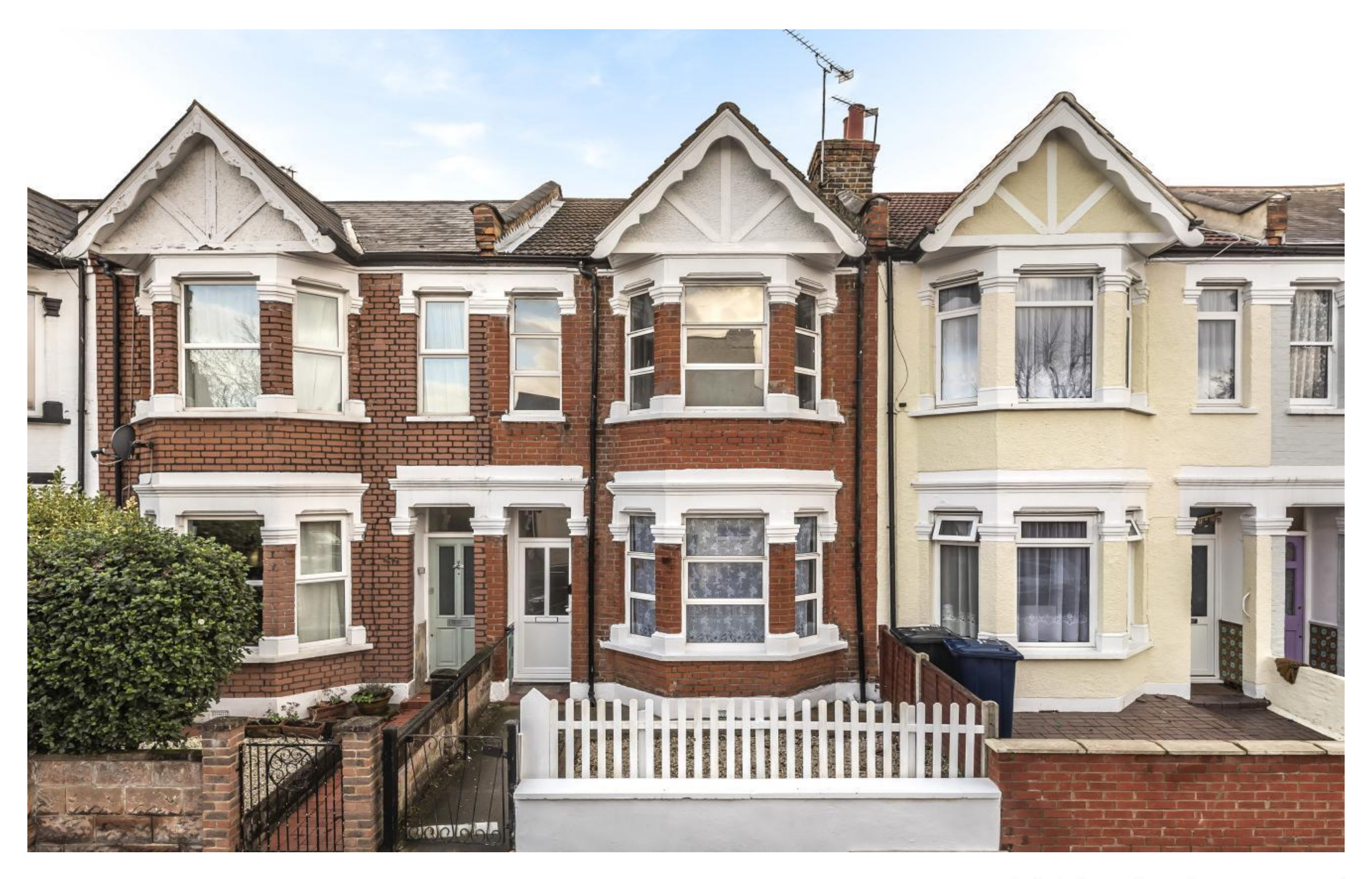
Westfield Road, West Ealing, W13