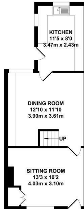
GROUND FLOOR APPROX. FLOOR AREA 401 SQ.FT. (37.29 SQ.M.)