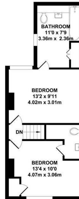
FIRST FLOOR APPROX. FLOOR AREA 401 SQ.FT. (37.29 SQ.M.)

TOTAL APPROX. FLOOR AREA 803 SQ.FT. (74.58 SQ.M.)