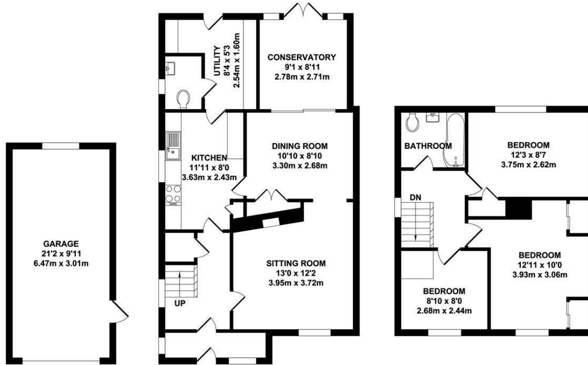
GARAGE 21'2 x 9'11 6.47m x 3.01m APPROX. FLOOR AREA 210 SQ.FT. (19.47 SQ.M.)