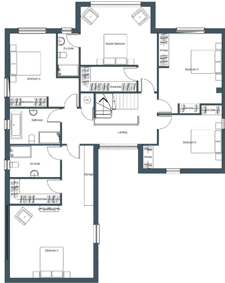
FIRST FLOOR PLAN AREA 160.8 m 2 / 1730.8 ft 2