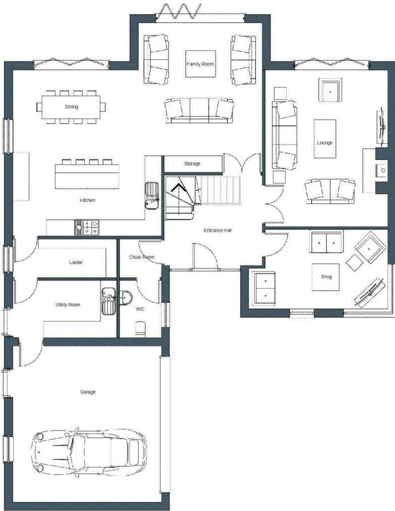
GROUND FLOOR PLAN AREA 127.4 m 2 / 1371.3 ft 2 TOTAL FLOOR AREA 288.2 m 2 / 3102.2 ft 2