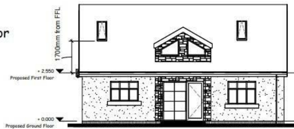
Proposed Front Elevation 1 : 100