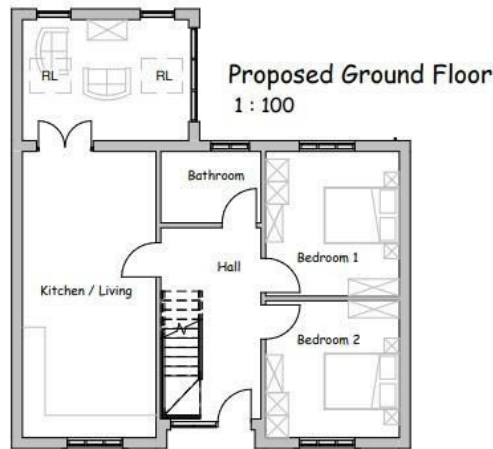
Proposed Ground Floor 1 : 100