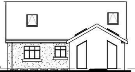
Proposed Rear Elevation 1 : 100