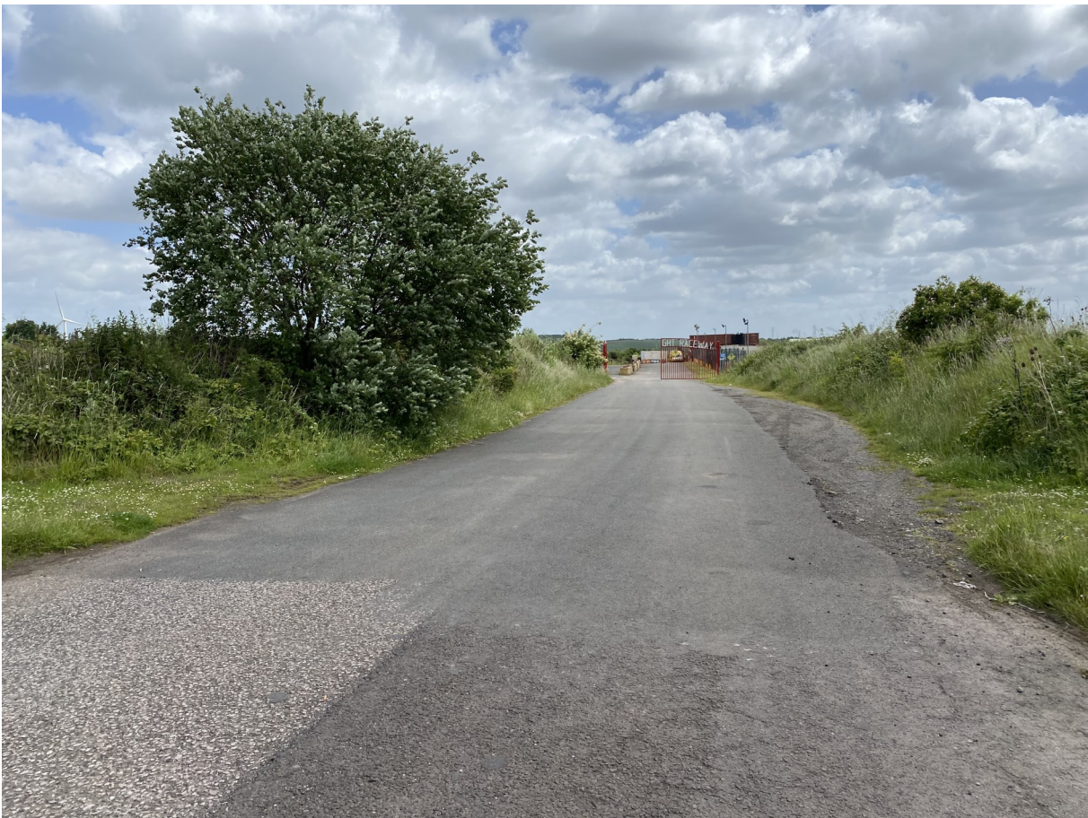
Unadopted road to the south of the site.