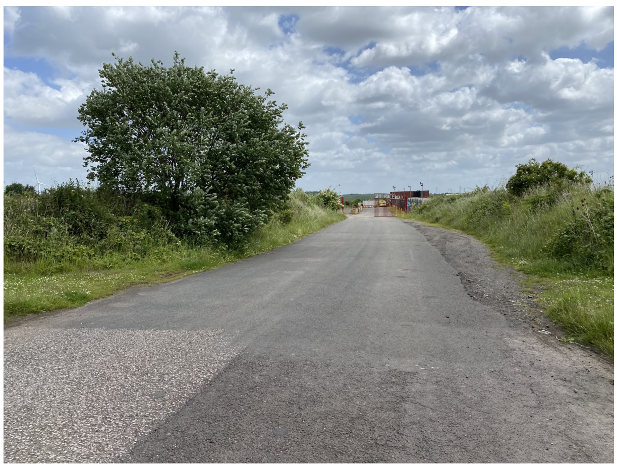
Unadopted road to the south of the site.