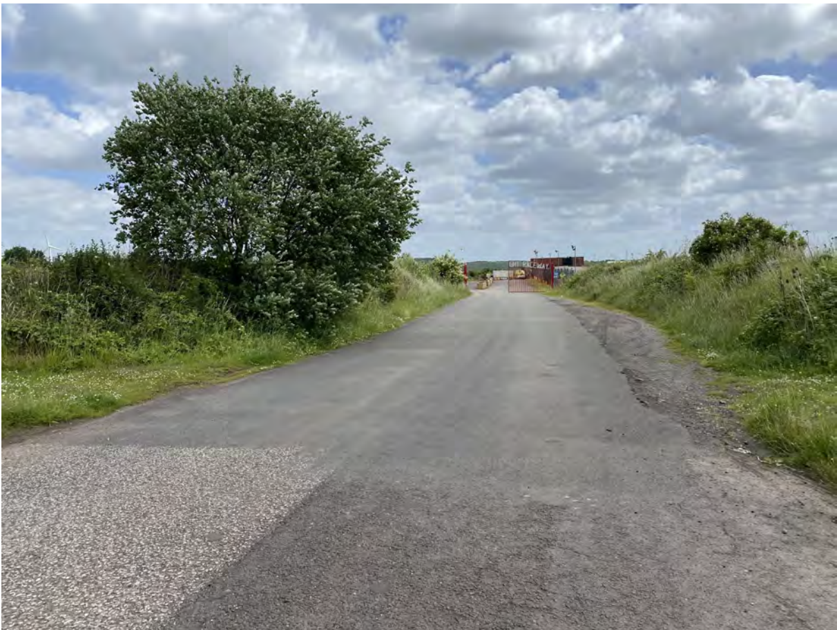
Unadopted road to the south of the site.