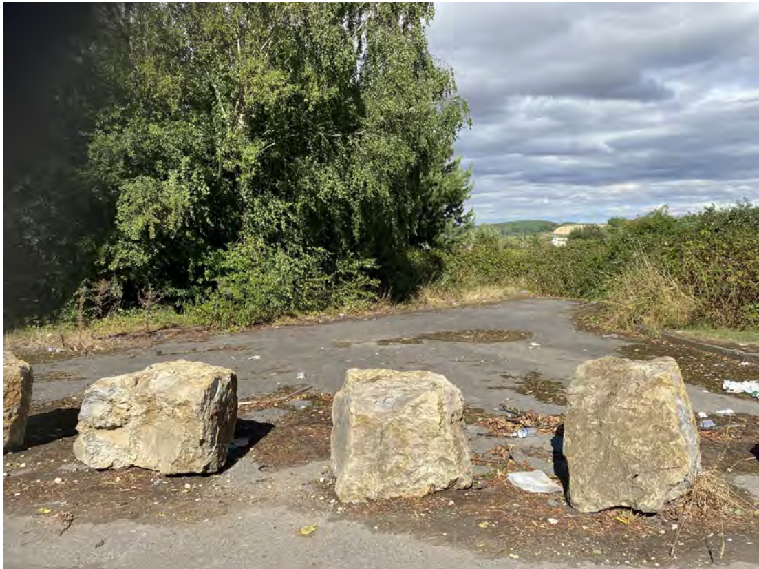
Former entrance to the south of the site from Normanby Road.