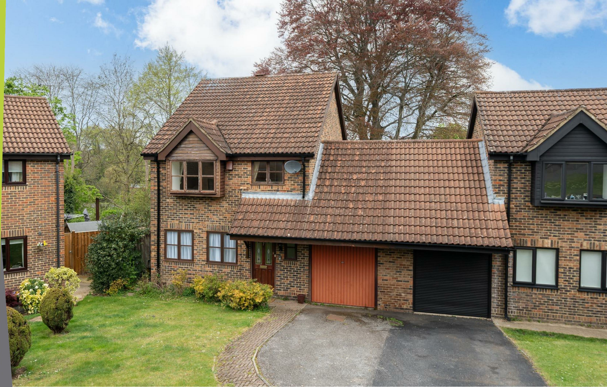
The Sycamores, Felden, HP3 0LL Asking price £675,000