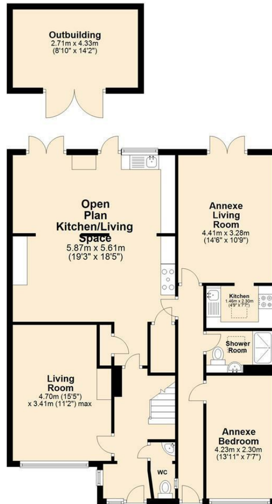
Ground Floor Approx. 112.8 sq. metres (1214.3 sq. feet)