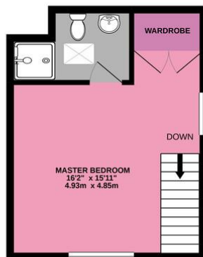
2ND FLOOR 279 sq.ft. (26.0 sq.m.) approx.