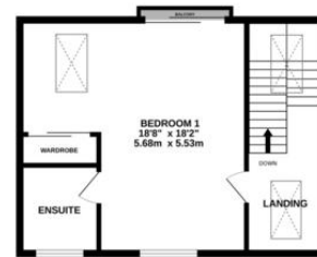
2ND FLOOR 463 sq ft, (42.8 sq m.) approx.