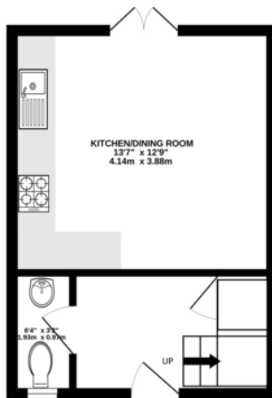
GROUND FLOOR 259 sq.ft. (24.1 sq.m.) approx.