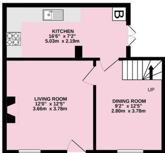
GROUND FLOOR 375 sq.ft. (34.8 sq.m.) approx.